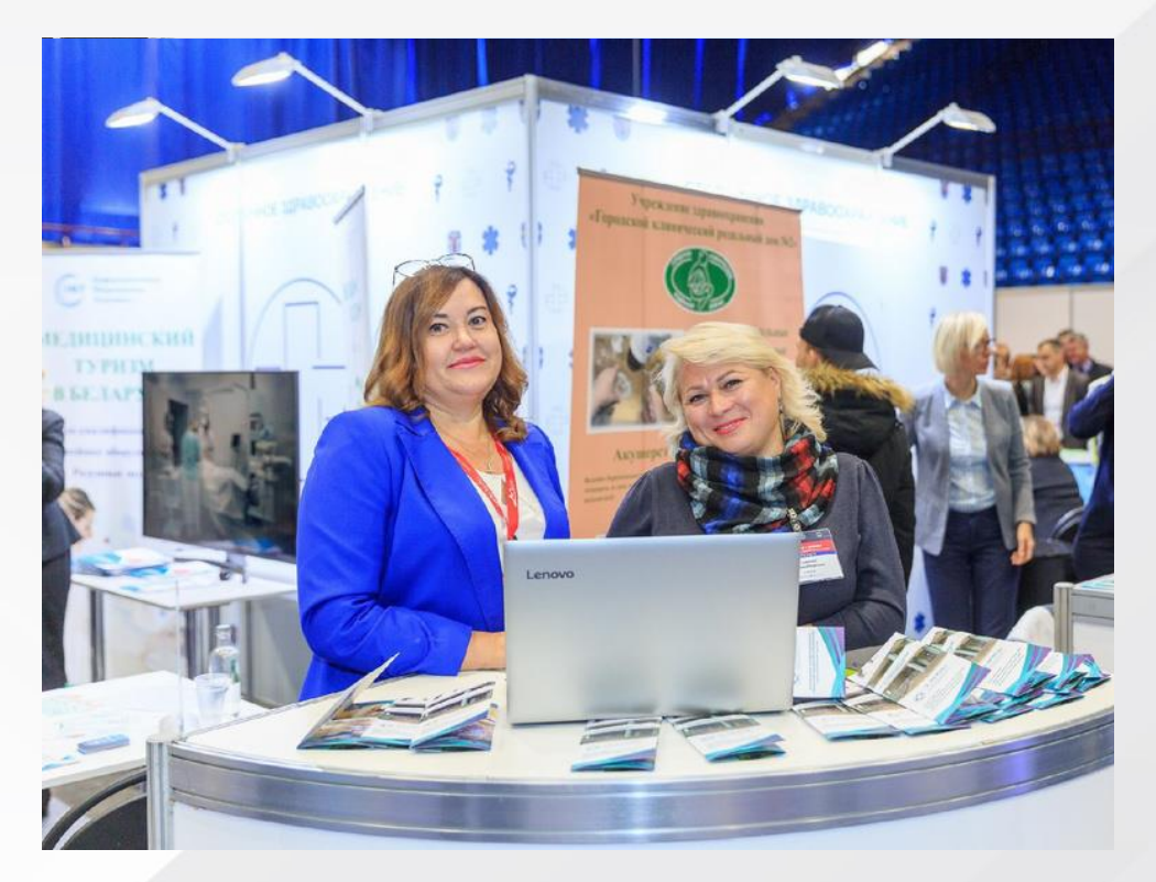
Place at the joint stand

Standard exhibition stand The price depends of the stand size and includes